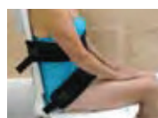
Pelvic & thoracic harnesses