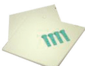
Corner and wide bath kit