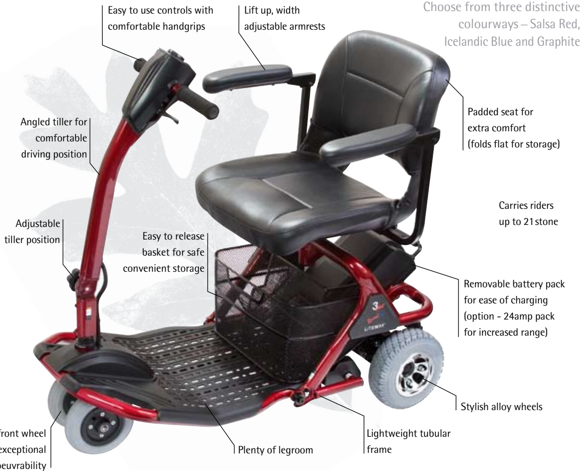
Easy to use controls with comfortable handgrips