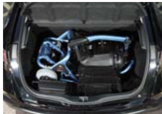
Easy to fold and load