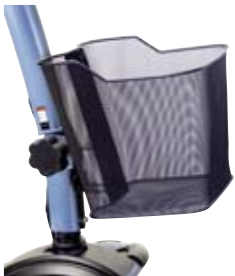
Front basket, swivel seat and 24amp battery pack