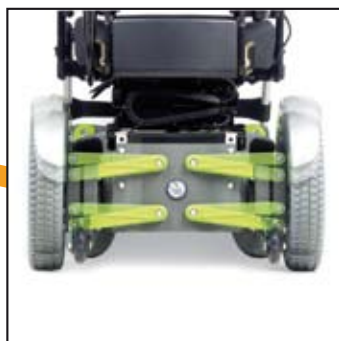
Unique suspension system