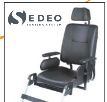
Sedeo seating system