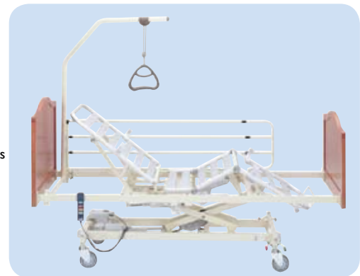
Easy to use hand control

The Scan Bed 750 excels in its ergonomic design, allowing the user an exceptionally high degree of freedom and autonomy. Inclining backrest and adjustable thigh section facilitate maximum comfort in sitting and resting positions, ensuring best possible blood circulation - rest, relaxation and pressure relief.