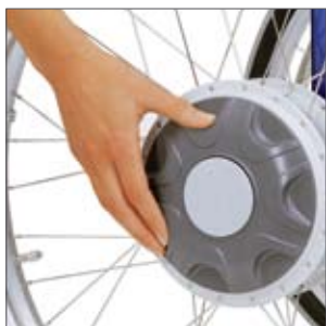
Simply couple up or uncouple the drive wheels

The e-fix is also very easy to push by hand if the situation requires it: just uncouple the drive wheels with a simple movement and your wheelchair can be propelled manually in the usual way – either by using the outer wheels for the hands or by another person pushing.