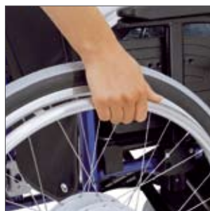
Move with hand power or electric power as you wish!