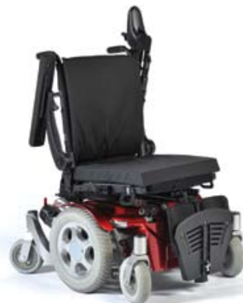
Flip-up armrests and foot rests for easy accessibility