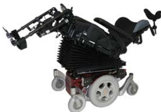
Lift-off backrest for easy transportation and storage