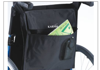
Back rest bag