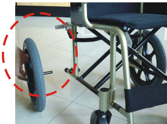
Quick release transit wheels