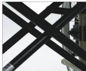
Double cross brace