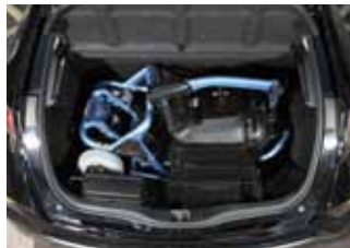
Easy to fold and load